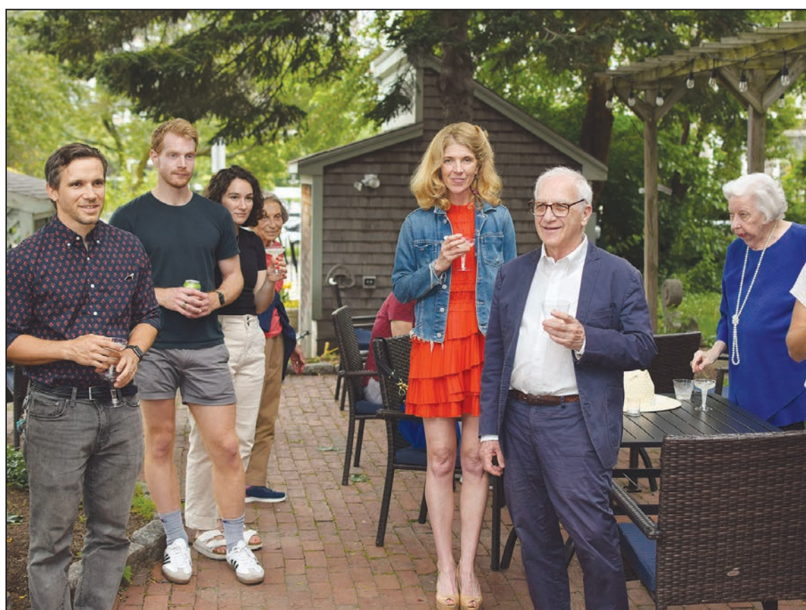
Garden Tour hosts and sponsors gathering to cheer with champagne during the June 16 Garden Tour Campaign Reception in the Gardens for Charlestown.